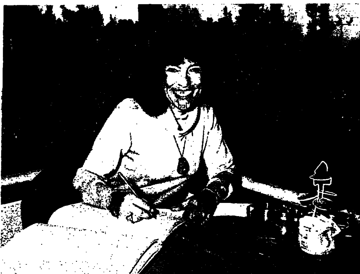
Author Janet Dailey.